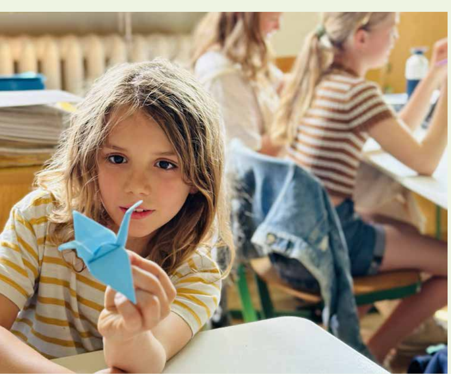
Pupils at a Kreuzberg school make cranes as peace symbols in life skills lessons to mark World Humanist Day 2023 under the motto "Longing for peace".

From humble beginnings, our humanistic life skills lessons (Lebenskundeunterricht) have developed into an important pillar of value-oriented education in Berlin and Brandenburg. Over the past 40 years, more than 400,000 pupils have taken part: A good opportunity to look back.